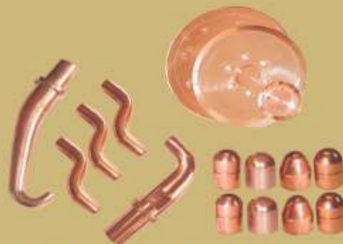
Resistance Welding Products