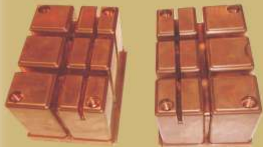
Plastic Mould Materials