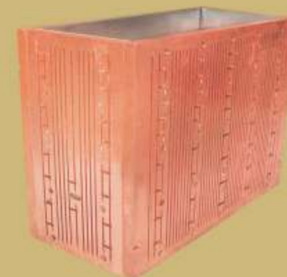
Continuous Casting Mould Plates