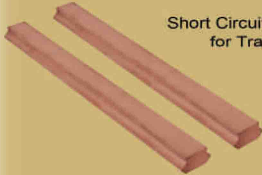
Rotor Wedge Profile For Turbo Generators