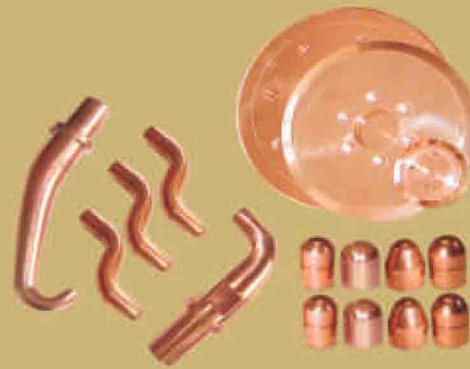
Resistance Welding Products