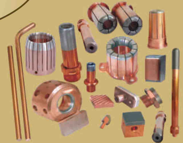
Electrical Switchgear Contacts