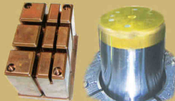
Plastic Mould Materials