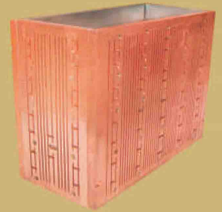
Continuous Casting Mould Plates