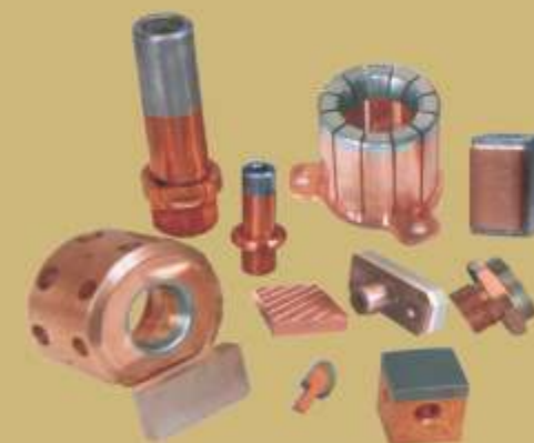
Electrical Switchgear Contacts