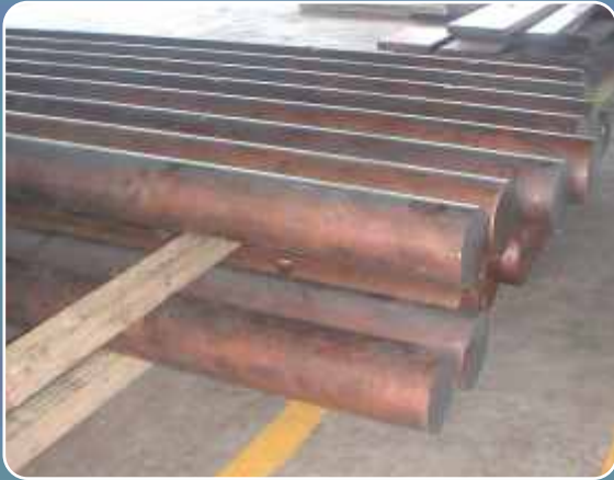
Ø200 MIPALLOY 3ZR (Cr Zr Cu) BILLETS