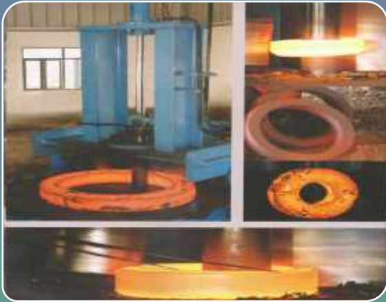
RING ROLLING OF SHORT CIRCUIT RINGS