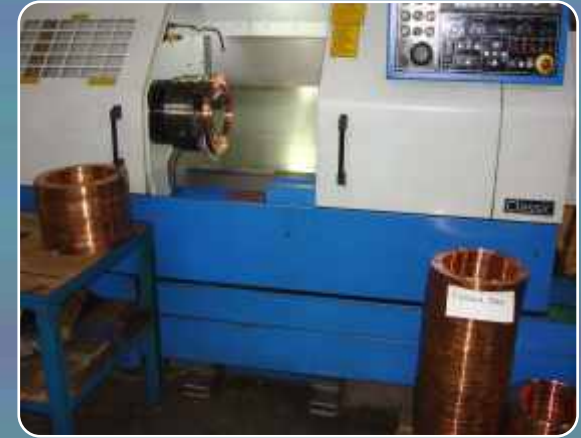
MACHINING OF SHORT CIRCUIT RINGS