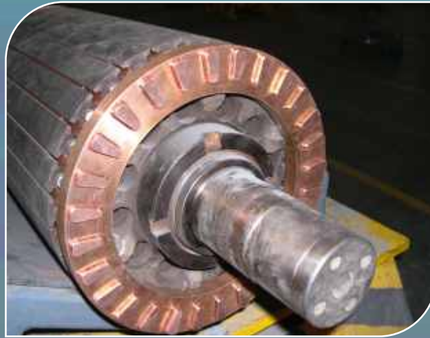
ROTOR WITH MIPALLOY 3ZR (Cr Zr Cu) SHORT CIRCUIT RINGS