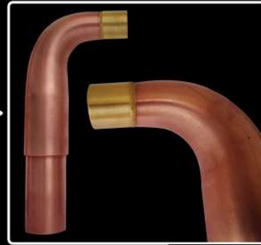
After EB Welding