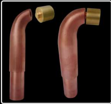
Before EB Welding