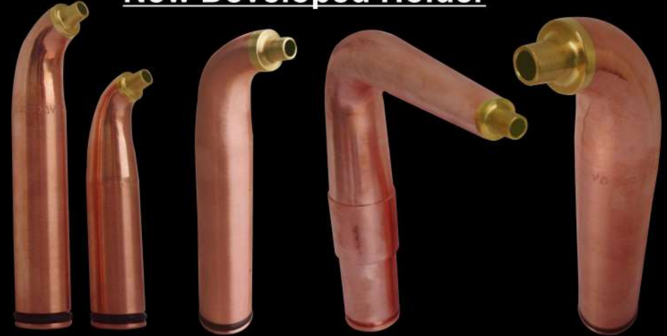
Beryllium Copper Nipple Electron Beam Welded to Chromium Zirconium Copper Holder Body