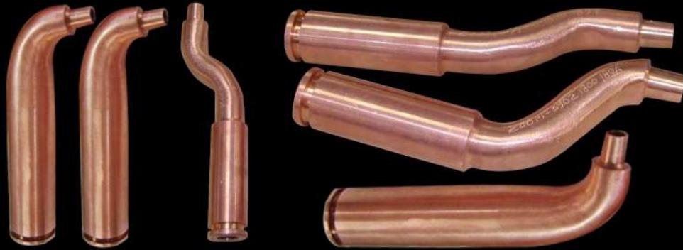
Full Electrode Holder Constructed in Chromium Zirconium Copper

Problems associated with Electrode Holders made up of Chromium Zirconium Copper: